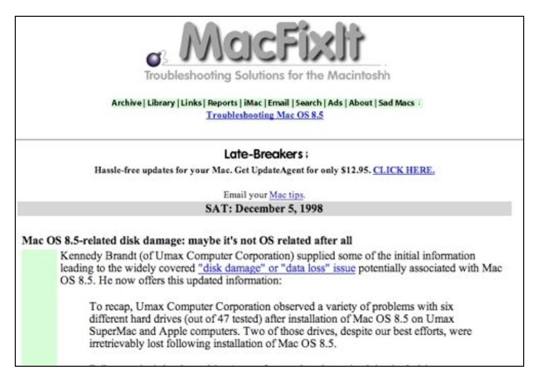
MacFixIt: December 1998

MacFixIt Toolbox Awards. These awards (for best troubleshooting-related software) were first given in December of 1998, and intermittently thereafter. The big winners in this first year were Conflict Catcher and Data Rescue .